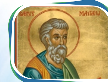
St. Mathew Apostle (Feast on 21st september)