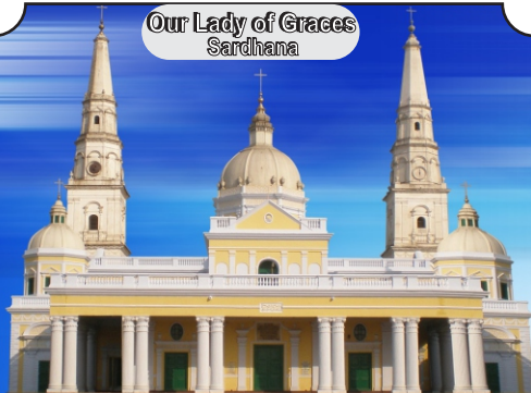
Our Lady of Graces Sardhana

6) Kindly leave the Church Hymn books at Hymn Book trolley in the Church itself.