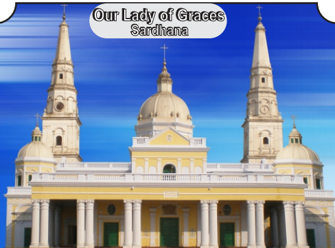
Our Lady of Graces Sardhana